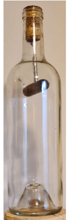
Step 5 – Let the ice melt, and drain the water, only to pull the tiny tubes out