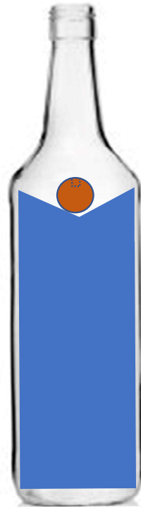
Step 3 – Place wooden handle inside, with a hole at the center