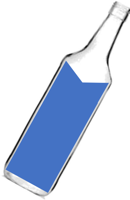
Step 2 - freeze water with 2 nd diagonal